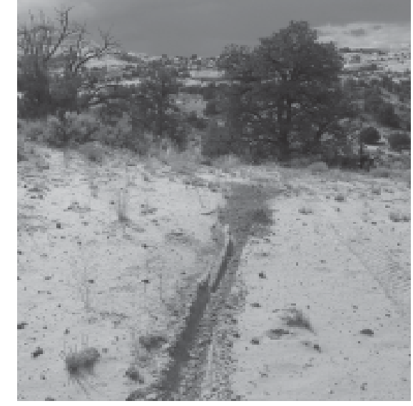
Deep tracks in the sand leave an ugly mark.

Time has rushed forward, technology creating threats to wild continued on next page