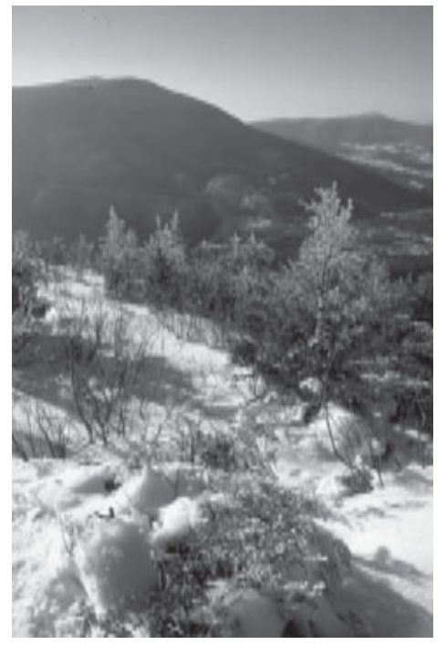
Big Branch Wilderness.

This fall Congress will be voting on a bill that would sell off large amounts of public lands and divert millions of