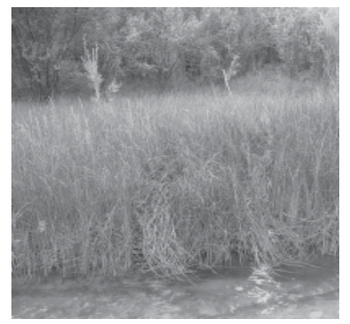
View of Deer Creek and its lush grasses and perennial waters.

Already the day was hot, the sun arched into the sky, desert sand slid beneath my shoes as I raced forward, intent on completing the final challenge of an outdoor program—a 10 mile run from the Gulch to Boulder, Utah. I was hot and thirsty, but the desert of southern Utah is not a forgiving place. Water, a cool breeze, shade—these are rare commodities in a landscape of