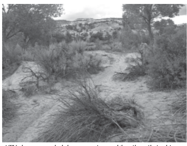
ATVs have trampled the vegetation and fragile soils in this once pristine area.

passed and now this place that holds a piece of my soul is under siege. In mid-July I returned to Deer Creek to seek its usual comforts, but found instead that the tracks of time have changed from footprints to tire tread. Despite Grand-Staircase Escalante National Monument rules, which limit travel to existing roads, ATVs have trampled reeds, run over willows, crossed the creek and muddied its waters. For over a mile I followed these new tracks, my gut knotted; my heart fractured. On the bench above the stream, more tracks—vegetation trampled, deep ruts ground into the soil, and fragile cryptobiotic soil crusts vanished under the crush of tire tread.