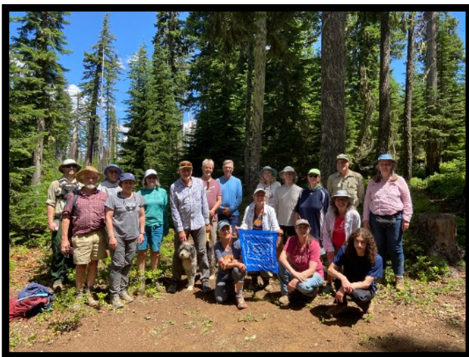
Wilderness Monitoring Training Class of '23

All people who monitor in 2024 will receive a Broads t-shirt, mileage reimbursement to and from the trailhead, and reimbursement for a meal if you spend 2 days out in a row without driving home. If you work at least 16 hours, you will receive a free Northwest Forest Pass and if you work at least 40 hours, you will receive a free Central Cascade Wilderness Permit for next year!