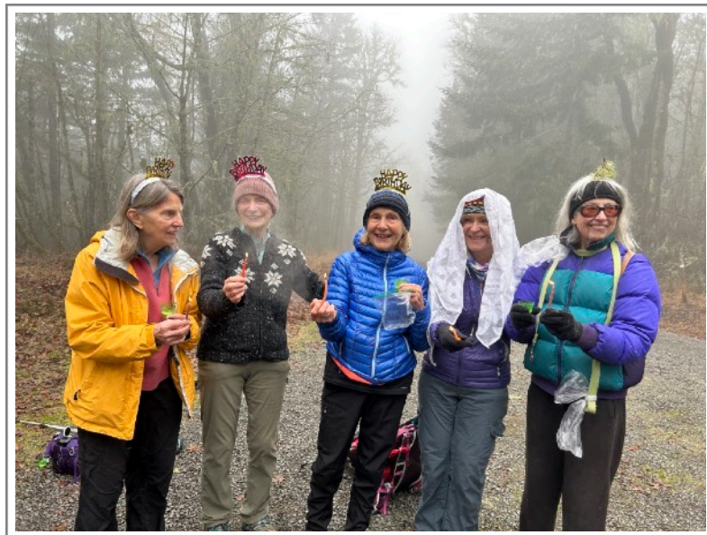
January Birthday Hike Across McDonald Forest 2023