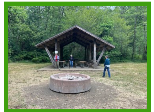
Canal Creek Campground

Full refunds will be given, minus some handling fees, up until July 15. Refunds will be given beyond that date if we can fill your spot. For more information contact Cyndi at 541-570-1055 or thebrownsvillehouse@gmail.com .