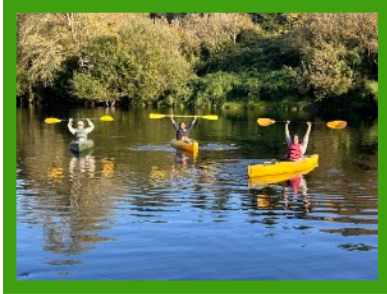
Kayaking on the Alsea