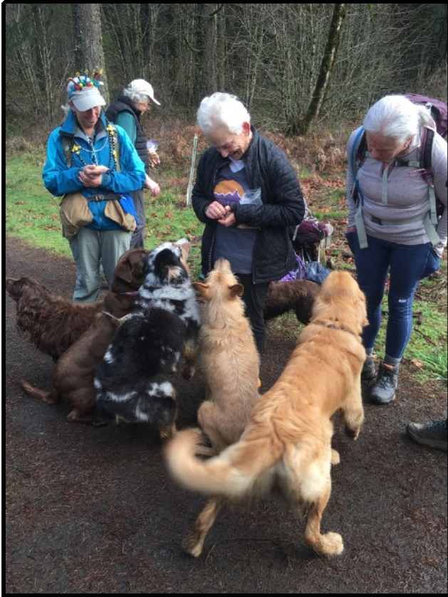
Six happy dogs and eighteen humans joined the February birthday hike.