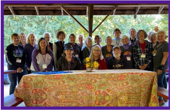
Annual Meeting and Potluck 2023