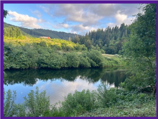
View of the Alsea River from Cyndi's Riverhouse and Siuslaw National Forest (in the distance).