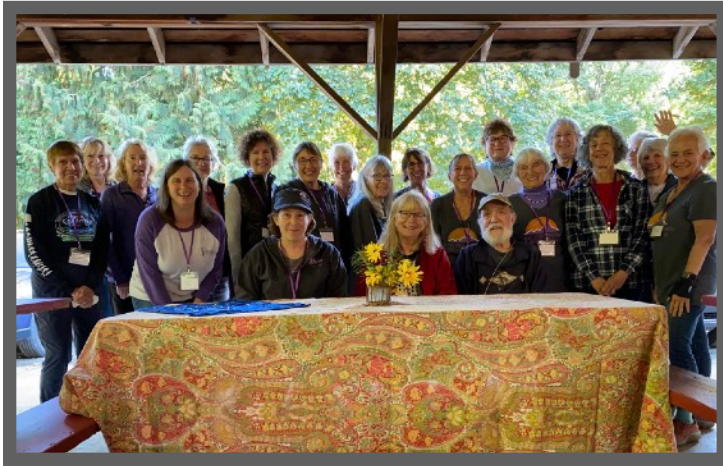
Annual Meeting and Potluck 2023