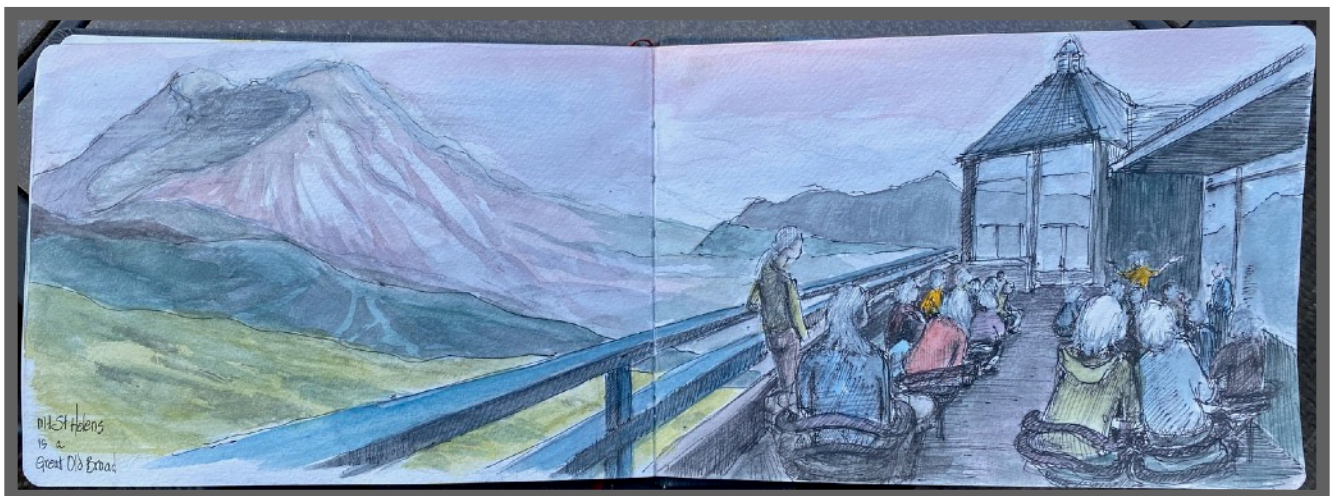
Broadwalk description and sketch by Peg Herring

Our sisters, the Cascade Volcanoes (of course!), brought in experts and eye-witnesses to tell the story of the volcano, the people, and the continuing efforts to protect against mining, logging, and intrusions into a region that continues to feel the effects of the 1980 eruption. And in Broad style, we celebrated that eruption with music and costumes from the 1980s.